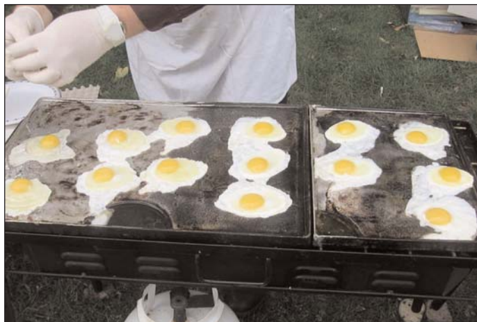
Eggs sunny side up.

The Kilwinning volunteers arrived early to prepare pancakes, eggs, ham, toast, coffee and juice for their guests. The breakfast was held at the refurbished former Wonderland Gardens, which proved a terrific venue. Keeping with tradition, the Royal Scots of Mocha Pipe and Drum Band entertained young and old. It was wonderful to have such a great turn-out to help celebrate the 50th year of Kilwinning Sunrise Service and Breakfast.